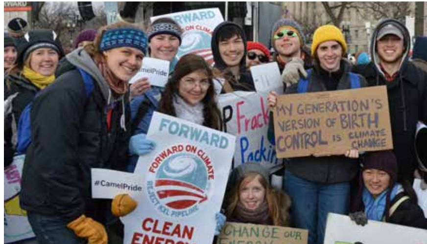
Certificate Program students participate in climate rally and Keystone XL protest