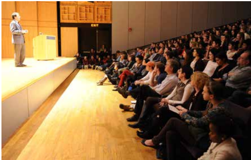
Nicholas Kristof, New York Times journalist, op-ed columnist and two-time Pulitzer Prize winner, speaks to a full-house at Connecticut College.

DURING THE SPRING SEMESTER , the College's five academic centers tried an experiment in integration, coming together to focus on a common theme throughout the semester and participating in overlapping events and discussions. The theme, global justice, linked the goals and identities of all of the centers, with environmental (GNCE), global (CISLA), social (Holleran and CCSRES), and digital (Ammerman) justice being important center foci. Working together, the centers developed a plan for a semester-long discussion that they opened to the entire campus community, with an excellent response. The keynote event for the semester's discussion of justice was an evening with Nicholas Kristof, a Pulitzer Prize-winning journalist, author, and long-time crusader for social justice around the world. With his public lecture focusing on gender discrimination in developing societies, the Goodwin-Niering certificate students, students from the other centers and those from almost a dozen spring courses, prepared for the presentation by reading his book, Half the Sky , and viewing the accompanying documentary. In the GNCE Certificate Program seminar, we devoted several weeks to issues of global gender discrimination, as well as examples of women's empowerment through environmental action reflected in the Greenbelt Movement of