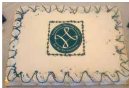
Goodwin-Niering Center 20th anniversary cake