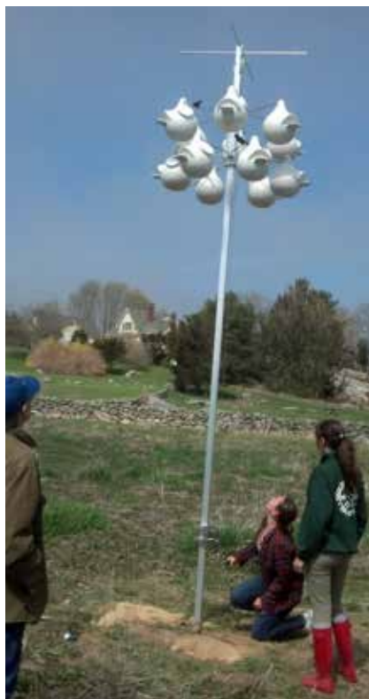
GNCE students erecting purple martin housing at Knox Preserve

ence was too passive. To address this issue and provide a better bonding opportunity, the sophomore-level course was expanded to four-credits by adding the new service-learning component. Now, sophomores meet as a group before the regular seminar time to work on projects that have tangible benefits for Avalonia and the surrounding community. This new service aspect of their academic program has helped to generate a sense of pride and meaning to the work that sophomores complete for the Center.